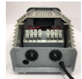
LTN1300 with two wire