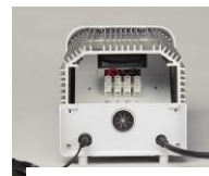
LTN1150 with single wire