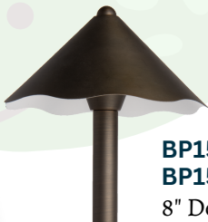
BP156BZ-A BP156BZ-2A 8" Deep Cone

Brass fixtures, choice of 8" dome, cone or deep cone style hat, choice of 12" or 18" stem, 12VAC dimmable LED