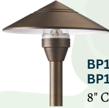
BP128BZ-A BP128BZ-2A 8" Cone