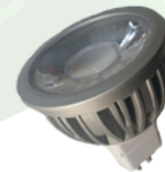
L115A4 LED 5W MR16 (CERTIFICATION #2019-207)