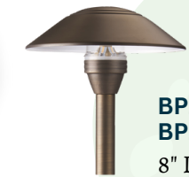
BP118BZ-A BP118BZ-2A 8" Dome