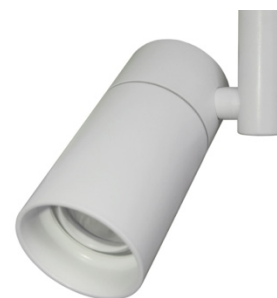
DOWNLIGHT NOW AVAILABLE IN WHITE