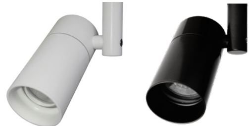
DOWNLIGHT NOW AVAILABLE IN WHITE and BLACK