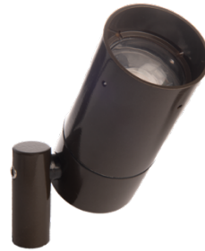
UPLIGHT ACU SERIES