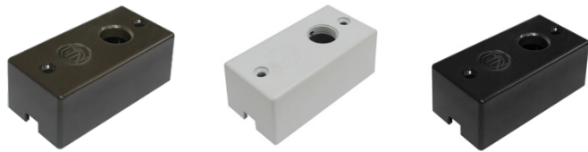
Optional Bases AX1ABSE – Bronze Finish AX1ABSE-WH – White Finish AX1ABSE-BK – Black Finish 2" x 4" x 1.5"

650 Algonquin Rd, Ste 206, Schaumburg, IL 60176 PH: 847.496.5276 FAX: 846.701.8342