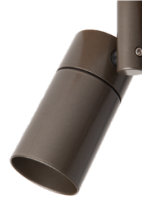
DOWNLIGHT ACD SERIES