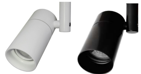
DOWNLIGHT ALSO AVAILABLE IN WHITE AND BLACK