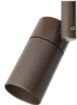
UPLIGHT ACU SERIES