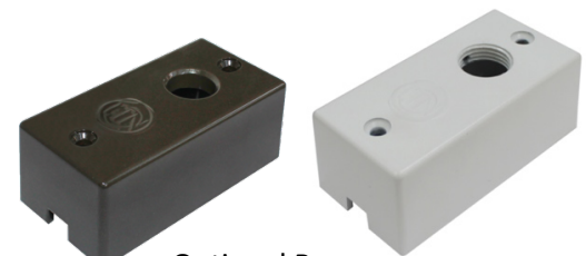
Optional Bases AX1ABSE – Bronze Finish AX1ABSE-WH – White Finish 2" x 4" x 1.5"

650 Algonquin Rd, Ste 206, Schaumburg, IL 60176 PH: 847.496.5276 FAX: 846.701.8342